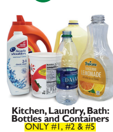
Kitchen, Laundry, Bath: Bottles and Containers ONLY #1, #2 & #5