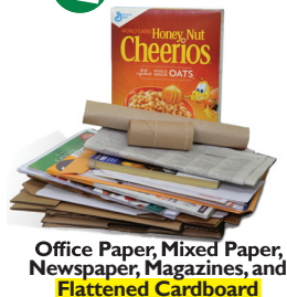
Office Paper, Mixed Paper, Newspaper, Magazines, and Flattened Cardboard