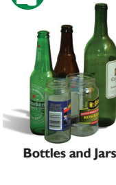
Bottles and Jars