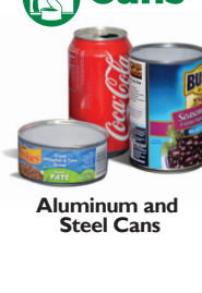
Aluminum and Steel Cans