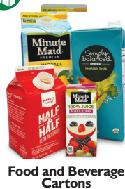
Food and Beverage Cartons